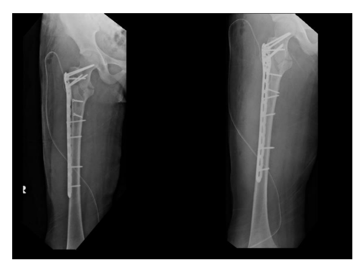
Figure 2: Radiograph of the right femur showing fracture fixed with PHILOS plate and two lag screws

Pre-contoured long PHILOS plate was used to complete osteosynthesis. Multiple 3.5mm locking screws were inserted through the proximal PHILOS plateinto the femoral neck. Subsequently, MIPO technique was used to insert screws along the shaft (Figure 2).