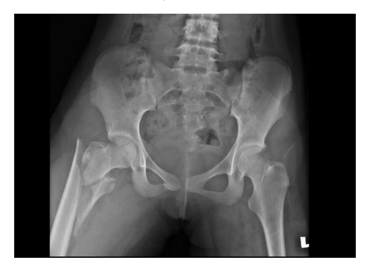
Figure 1: Radiograph of pelvis showing three-part spiral configuration with extension into the lesser trochanter

referred to psychiatry team for mental state examination to ascertain the cause for her suicide attempt.